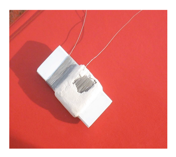
FIGURE 3. MgO over a double layer coil.